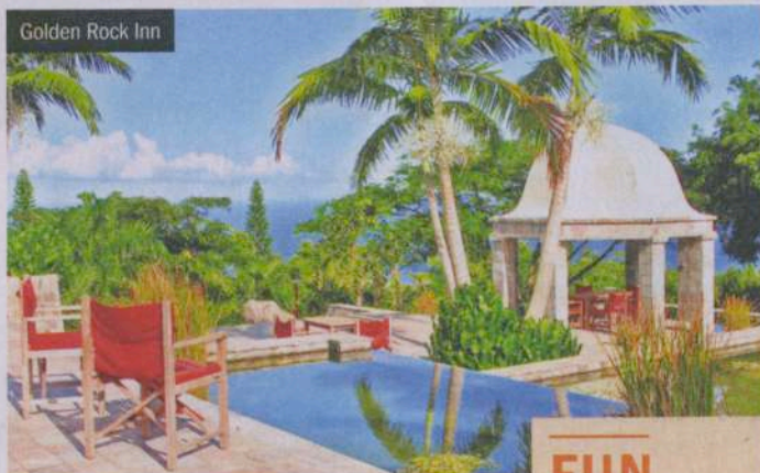
Golden Rock Inn

"Llewellyn's hot pepper sauce is a local favorite." —Tina